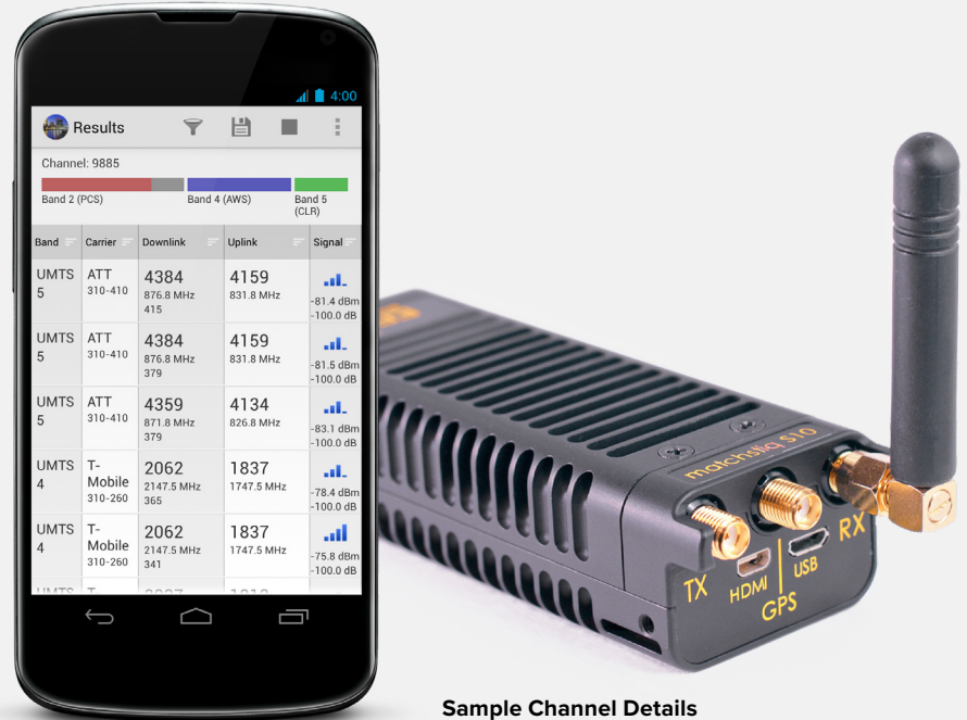
Sample Channel Details

Epiq Solutions software defined radios define state-of-the-art in small form factor and low power consumption, providing an ideal platform for mobile survey applications.