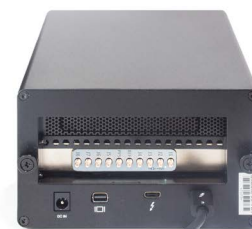
Sidekiq X4 housed in a Thunderbolt 3 chassis