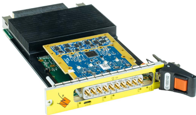
Sideiq X4 in a 3U VPX carrier card

For more information about Sideiq X4 and the available Development Kit options, please contact Epiq Solutions.