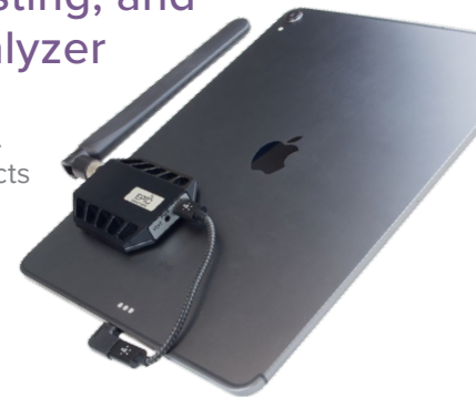
PRISM, shown mounted to a tablet, weighs under 24 grams (6 oz.)

Go beyond simple smartphone apps to get a detailed view of your cellular environment. PRISM is a self-contained, lightweight scanner and spectrum analyzer that easily connects to mobile devices to provide real-time, deep insight into coverage, interference and benchmarking. PRISM brings the power of large, expensive engineering tools to cost-effective handheld devices that can easily be used in the field. With PRISM, today's RF specialists get the tool they need to be productive and agile.