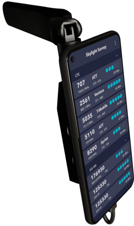
PRiSM mounted to smartphone

Offered with spectrum analyzer alone or with LTE, 5G NR, or P25 scanning software, or all technologies.