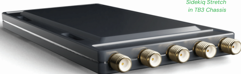
Sidekiq Stretch in TB3 Chassis

* Platform Development Kit (PDK) required for initial purchase.